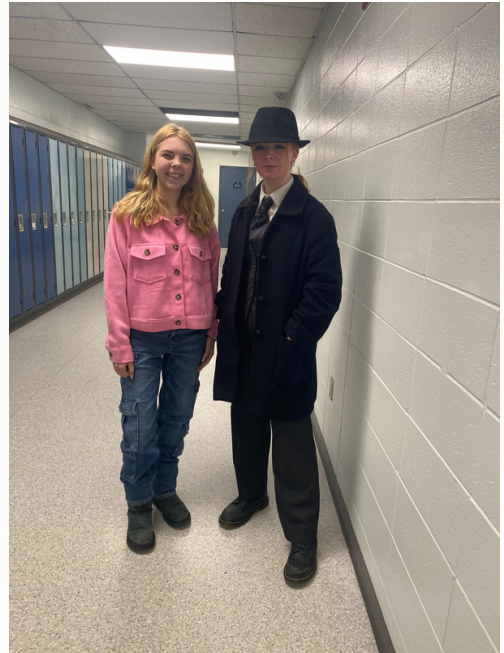
Barbenheimer Day - Leadership Event