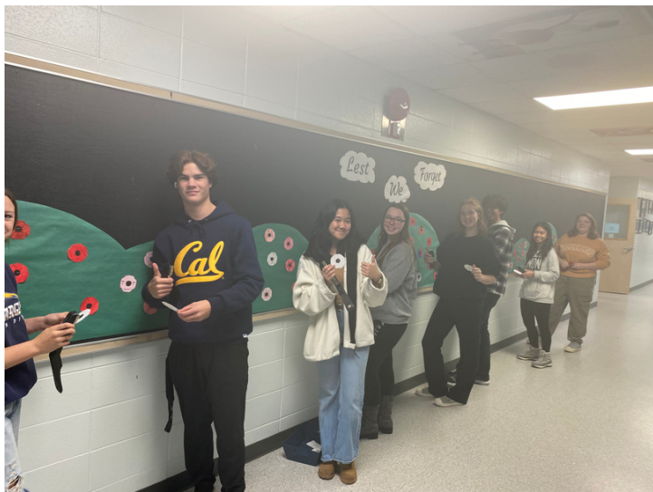
Leadership Team in Action!