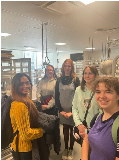
Students attending the SAIT Open House